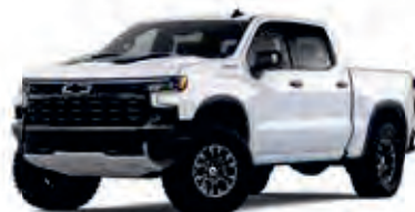
Summit White – GAZ