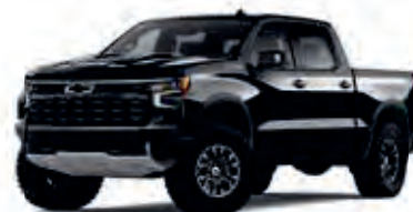
Black – GBA