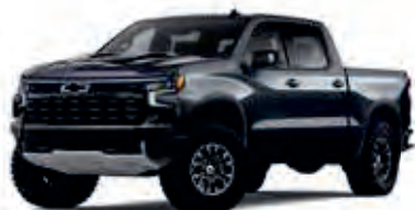
Dark Ash Metallic – G6M