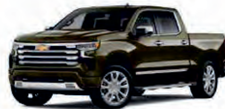
Harvest Bronze Metallic – GXN