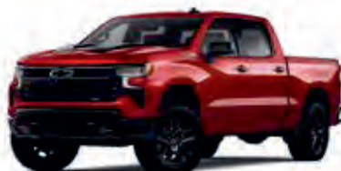
Radiant Red Metallic – GNT