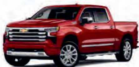
Radiant Red Tintcoat – GNT