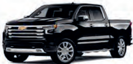
Black – GBA