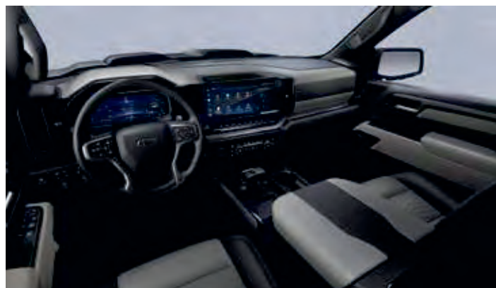
Greystone – H37