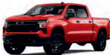
Red Hot – G7C