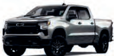
Sterling Grey Metallic – GXD