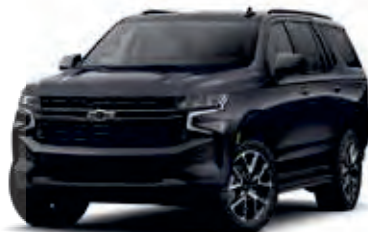
Dark Ash Metallic - G6M