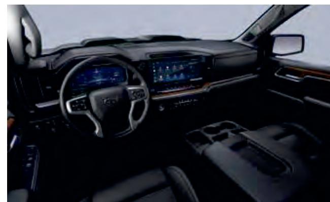
Leather Jet Black – H0Y