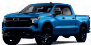
Glacier Blue Metallic – GLT