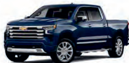
Northsky Blue Metallic – GA0