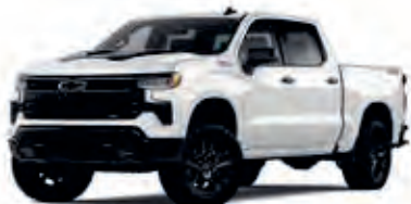
Iridescent Pearl Tricoat – G1W