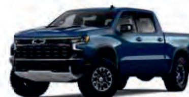
Lakeshore Blue Metallic – GXP