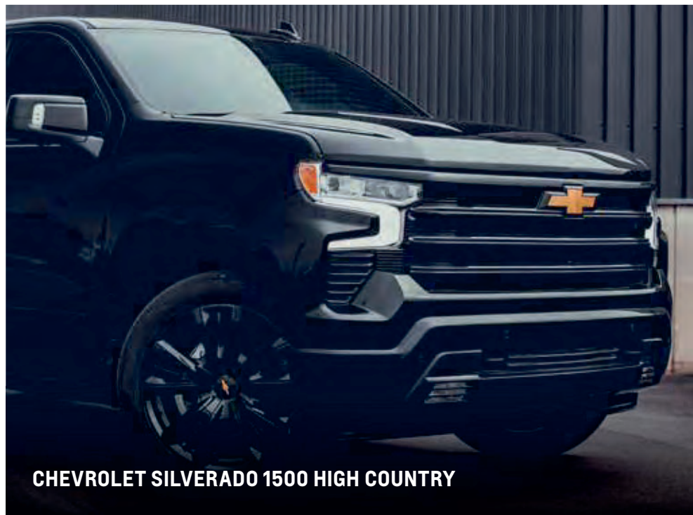
CHEVROLET SILVERADO 1500 HIGH COUNTRY