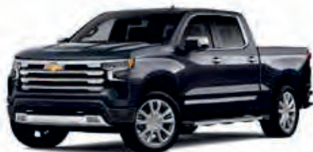
Dark Ash Metallic – G6M