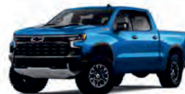
Glacier Blue Metallic – GLT