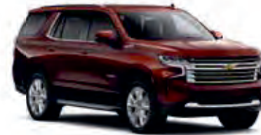
Auburn Metallic – G48