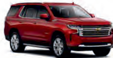
Radiant Red Tintcoat – GNT