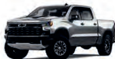
Sterling Gray Metallic – GXD