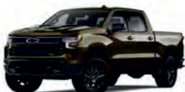
Harvest Bronze Metallic – GXN