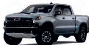
Slate Gray Metallic – GNO