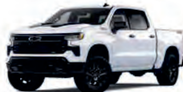
Summit White – GAZ