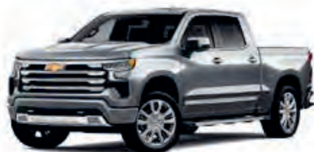
Sterling Gray Metallic – GXD