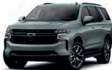
Silver Sage Metallic - G6N