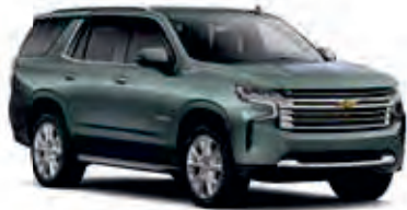
Silver Sage Metallic – G6N