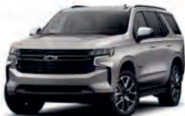
Empire Beige Metallic - GJW