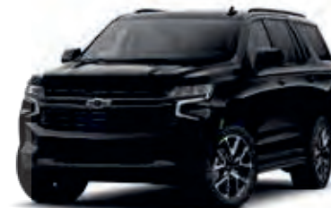
Black - GBA