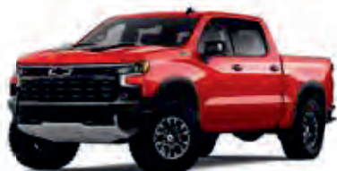
Red Hot – G7C