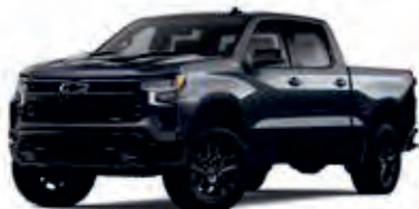
Dark Ash Metallic – G6M