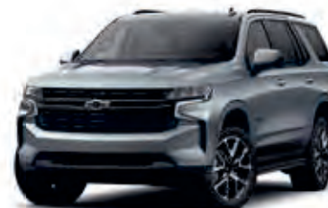
Sterling Grey Metallic - GXD