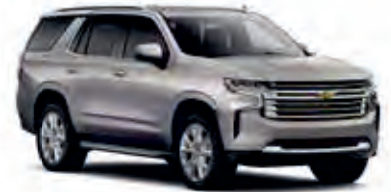
Empire Beige Metallic – GJW