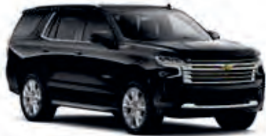
Black – GBA