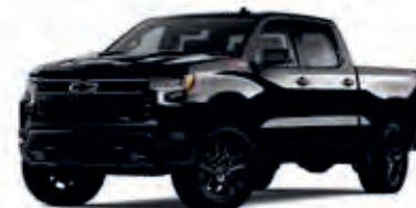
Black – GBA