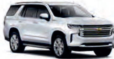
Summit White – GAZ