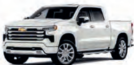
Iridescent Pearl Tricoat – G1W