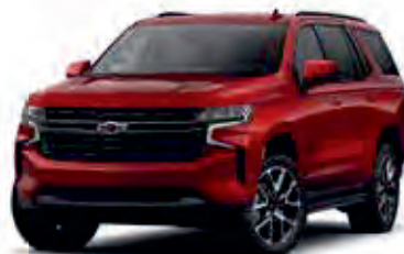
Radiant Red Metallic - GNT