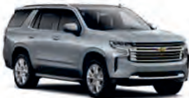
Sterling Gray Metallic – GXD