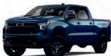
Lakeshore Blue Metallic – GXP