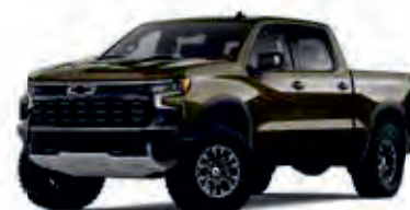
Harvest Bronze Metallic – GXN