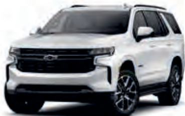
Iridescent Pearl Tricoat - G1W