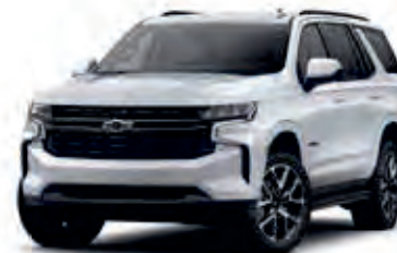
Summit White - GAZ