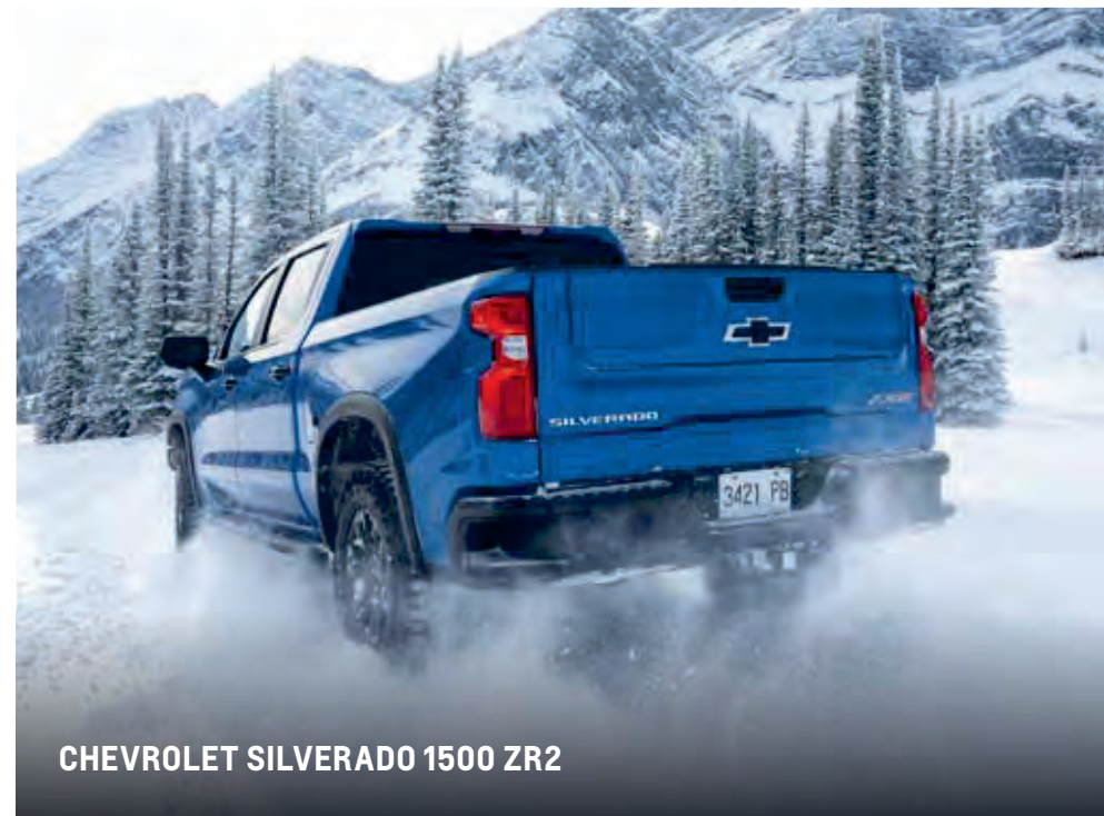
CHEVROLET SILVERADO 1500 ZR2