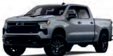
Slate Gray Metallic – GNO