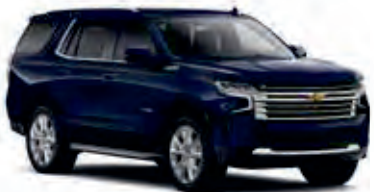
Midnight Blue – GLU