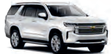
Iridescent Pearl Tricoat – G1W