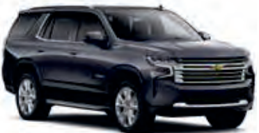
Dark Ash Metallic – G6M