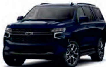
Midnight Blue Metallic - GLU